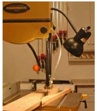
We built-in a handy work light on a flexible shaft to make seeing what you are doing a little easier.

We also added a handy work light, mounted on a flex shaft that allows positioning it where needed to best illuminate the work. The work light uses a 40-watt bulb that provides plenty of light on the table without causing glares or introducing unnecessary heat. The work light also has its own switch so it can be turned on only when needed independently of the POWERMATIC PWBS-14 Bandsaw motor